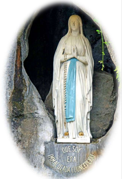
February 11, Our Lady of Lourdes Feast Day